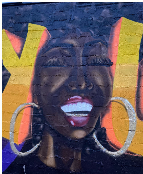
'BeYOUtiful' Acrylic Outdoor Paint Approx. 300 sq. ft. Rivers of Steel New Kensington, PA October 2021