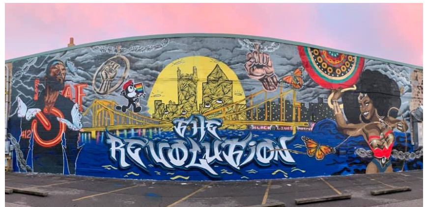
'Black AF Edition'

Spray Paint on Brick Wall Approx. 100 sq. ft. Beltzhoover B.N.C. Beltzhoover, Pittsburgh, PA September 2020