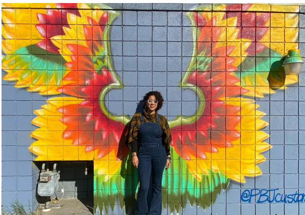
'Spread Your Wings'

Digital Illustration, Printed on Vinyls New Space Spheres Project (PDP & JY Originals) Downtown, Pittsburgh, PA September 2020