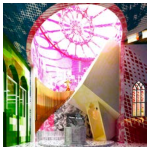
The American Mashup Carnegie Mellon University