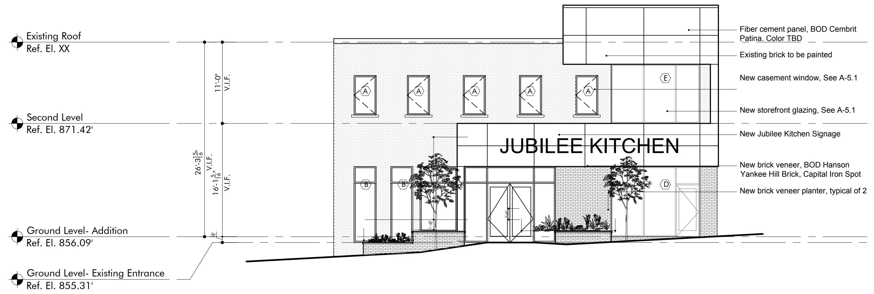
1 South Elevation 1/8" = 1'-0"